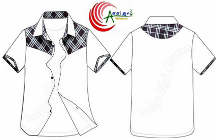
SS006-7 '4 2# L